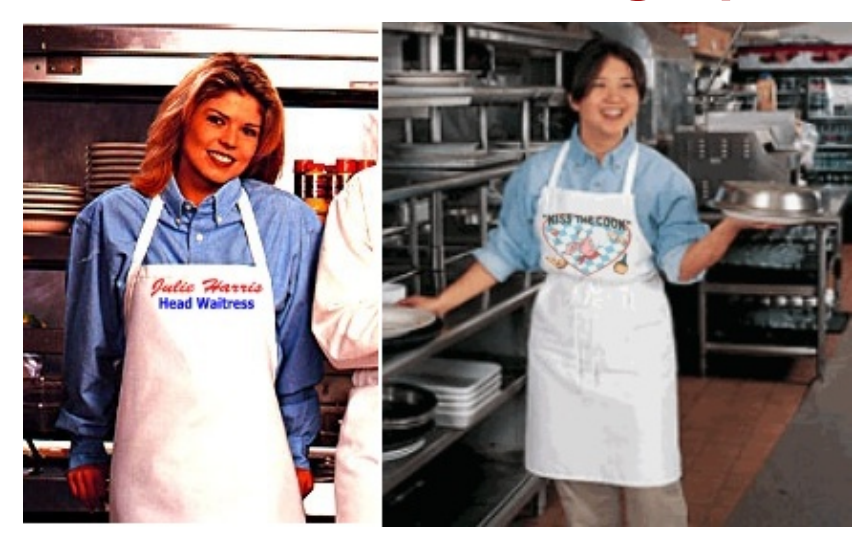
a great gift idea for anyone ... including yourself!

We'll inscribe two lines of YOUR text in a variety of colors YOU choose. You can be like a professional chef with a name and title! Create a personalized cooking apron for yourself or as a great gift idea for anyone that cooks.